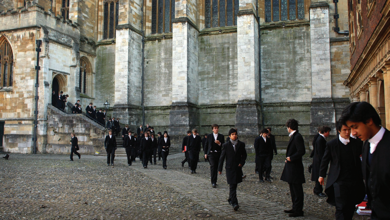
In science, like many other professions, better-off individuals and those educated at elite institutions such as Eton College, UK, are often over-represented.