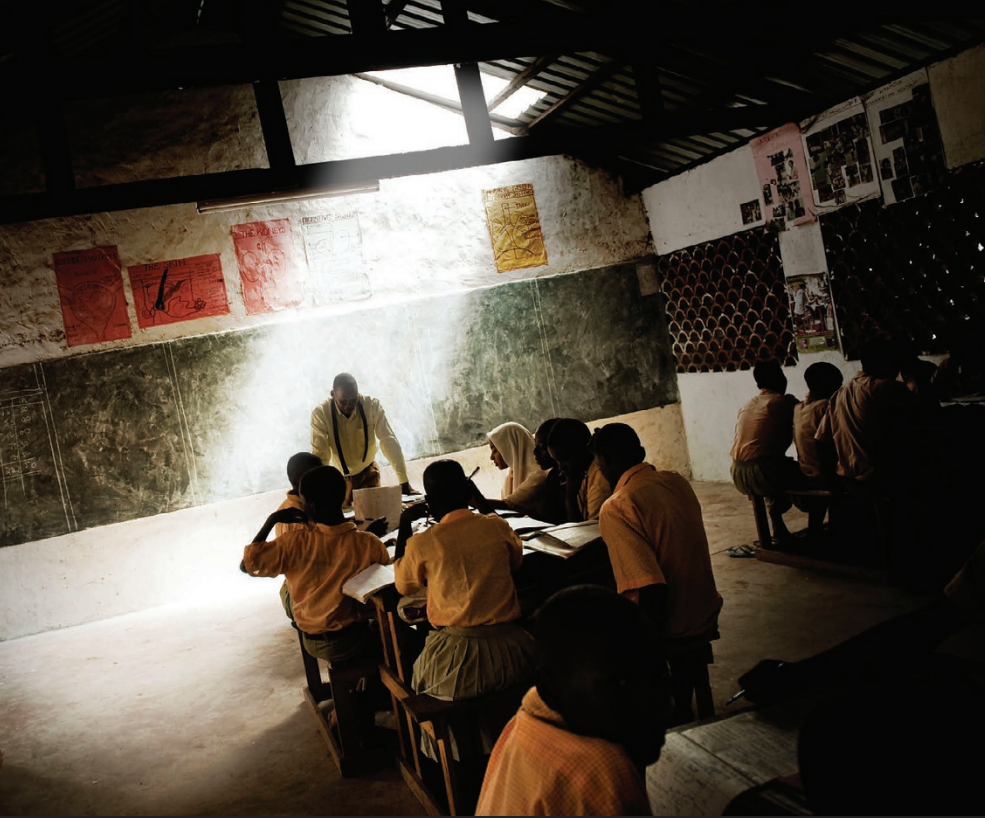
Poor students from Kenya are often interested in science, but struggle to make it a career.