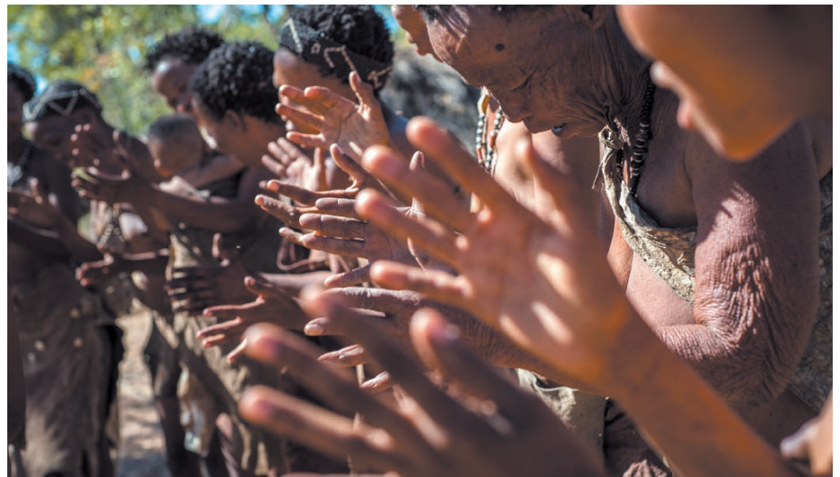
A traditional San dance performed at a living museum in Namibia.

The impetus for the ethics code was the 2010 publication, in Nature 1 , of the first human genome sequences from southern Africa: those of Archbishop Desmond Tutu, winner of the 1984 Nobel Peace Prize, and four San men from Namibia. The Namibian government and