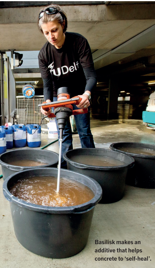
Basilisk makes an additive that helps concrete to 'self-heal'.

millimetre wide to be sealed. By including that proportion of mixture, “you double the price of the concrete mix,” Jonkers says. But he points out that the price of concrete is about 1% of the overall cost of building a bridge, and the additive should lead to savings in repair and maintenance.