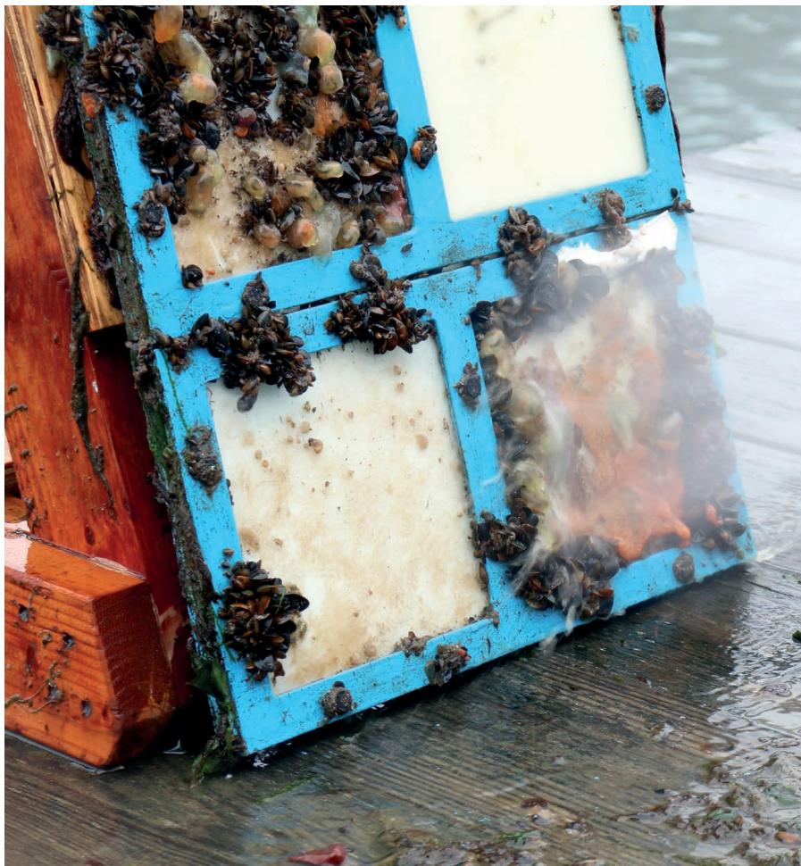
Specially developed paints help to deter marine fouling in field trials.

By placing large dampers at locations between concrete structures where the