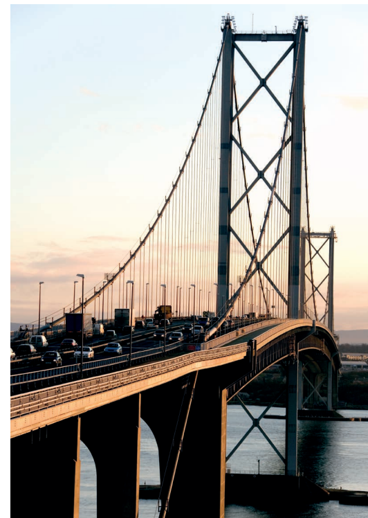
8power's device was tested on the Forth Road Bridge.