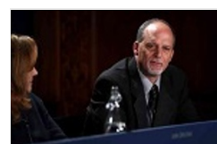
US astronomers rally to end sexual harassment