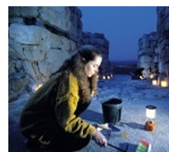
Social behaviour: Indecent advances