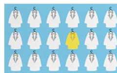
Science and gender: Scientists must work harder on equality