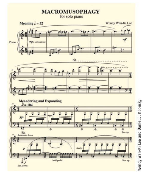
Macromusophagy is a musical score developed at the Chinese University of Hong Kong and the University of Michigan.

Autophagy is a process of cellular housekeeping in which dysfunctional organelles, aggregated macromolecules, misfolded proteins or pathogens are removed and degraded. Some of the metabolites are reused. Autophagy is also dynamic—it helps cells