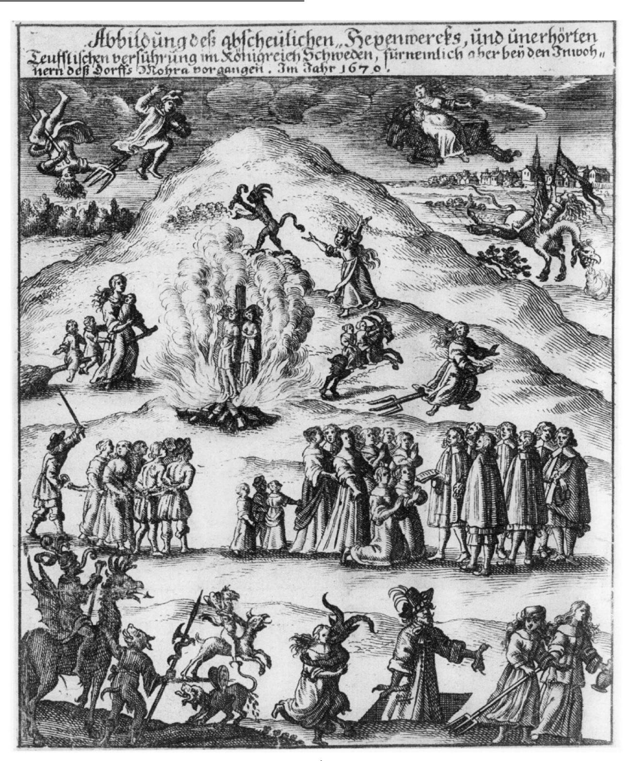
Fig. 2 A trial and execution of 'witches' in Mora, Sweden in the 17<sup>th</sup> century. Public domain. Unknown artist. This work is in the public domain in its country of origin and other countries and areas where the copyright term is the author's life plus 100 years or fewer.

Although there are no witches or saints associated with Haemopoietic Cell Transplantation (HSCT) the idea of stem cells and their capacity for longevity seems to contain some magical qualities [5]. The term stem cells was coined by Boveri and Haecher in the 19<sup>th</sup> century, however Pappenheim, Maximov and Neuman contributed major insights to the theory of haemopoietic stem cells. In the 1960s Till and McCulloch are credited with