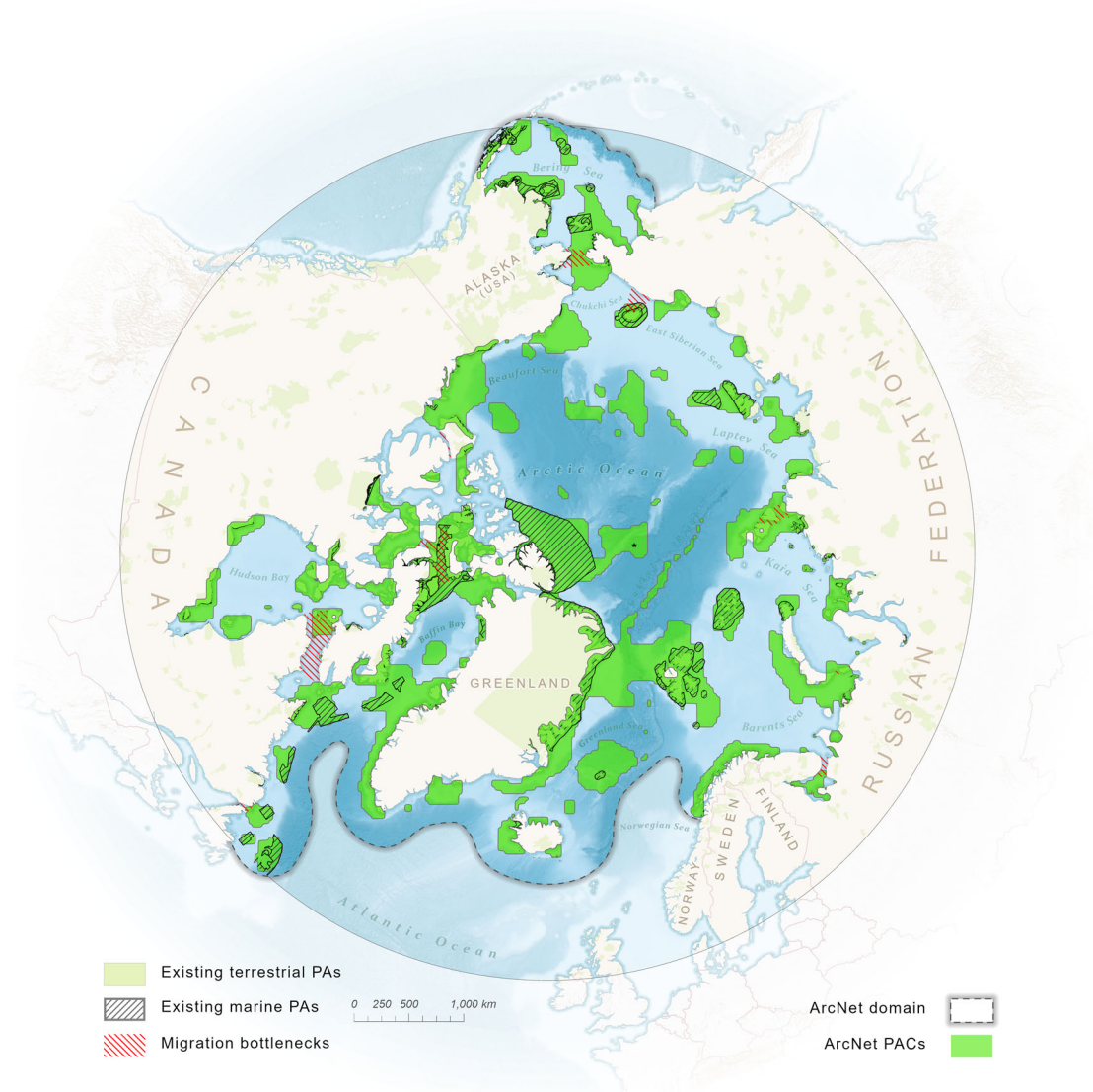
Fig. 1 | The ArcNet domain and PAC network. The ArcNet domain was defined by the southern border of the 18 PAME-defined regions of the Arctic Ocean and adjacent seas, known as the Arctic Large Marine Ecosystems (LMEs) 33 , and focussed on the Arctic realm as defined by the Marine Ecoregions of the World 58 , with some

modifications (see Project scope and defining parameters in SI). The network of 83 PACs was designed to include existing marine protected areas (PAs, as shown in figure), but the migration bottlenecks were determined separately and were not included in the Marxan analysis (see Post-Marxan analyses in SI).