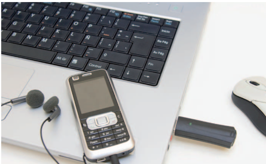
A powerful but unmonitored greenhouse gas, nitrogen trifluoride, is used in the manufacture of LCD screens for many electronic gadgets.

If all the \text{NF}_3 produced this year were to be released into the atmosphere, it would be on par to adding 67 million tonnes of carbon dioxide to the air. In 2005, carbon dioxide emissions exceeded 15 billion tonnes globally. However, most of the \text{NF}_3 produced is destroyed and never reaches the atmosphere. Two earlier studies found that only two to three per cent of the gas escapes destruction after its use 3,4 .